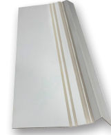
Ross ® Universal Z-Flashing