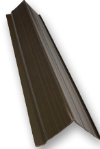
Ross ® Vinyl Drip Edge